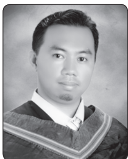
Arch. Archiemoore Ente Palaci